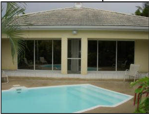
Guest house with pool