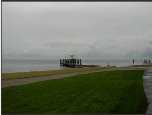
View of the dock.