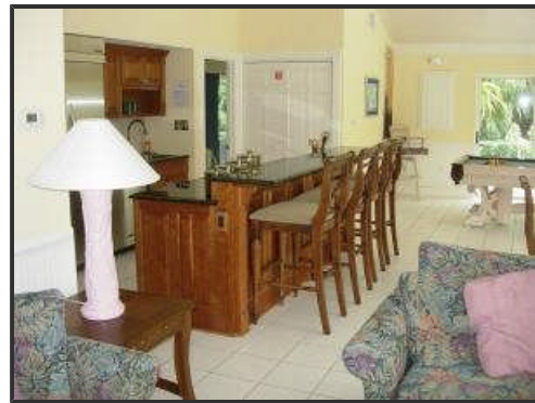
interior of Guest House